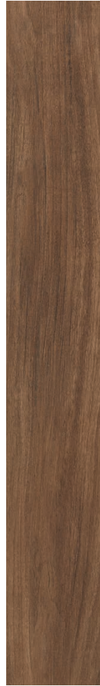
10 x 70 cm (4 x 28) MZ.WE.WAL.0428

All items shown in this document are part of Olympia's stocking program. For special orders, please contact your Olympia Tile Sales Representative.