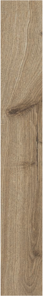
10 x 70 cm (4 x 28) MZ.WE.BGE.0428