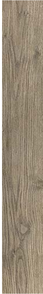
10 x 70 cm (4 x 28) MZ.WE.BWN.0428