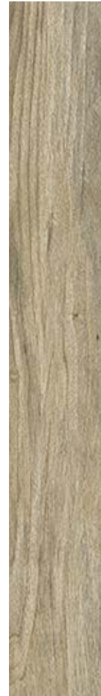
10 x 70 cm (4 x 28) MZ.WE.HNY.0428

All items shown in this document are part of Olympia's stocking program. For special orders, please contact your Olympia Tile Sales Representative.