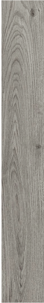
10 x 70 cm (4 x 28) MZ.WE.GRY.0428